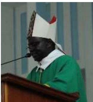
Monsignor André GUEYE, Bishop of Thiès

The Assembly brought together 47 national delegates, an additional delegation of 11 Koreans and some 20 Senegalese representatives. These delegations represented 32 national movements and organizations from 5 continents : 12 African delegates from 9 movements, 11 Latin American delegates from 9 movements including Mexico, 10 Asian delegates from 7 movements and 14 European delegates representing 7 movements. Six Asian delegates were prevented from traveling by the emmigration authorities of their respective countries but had participated in preparatory works. Functionally about twenty MARCS participants mobilized to support this gathering, to welcome delegates upon their arrival, and support during the immersion (field visit), participating in exchanges during the seminar and in the opening and closing celebrations at cathedral inThies