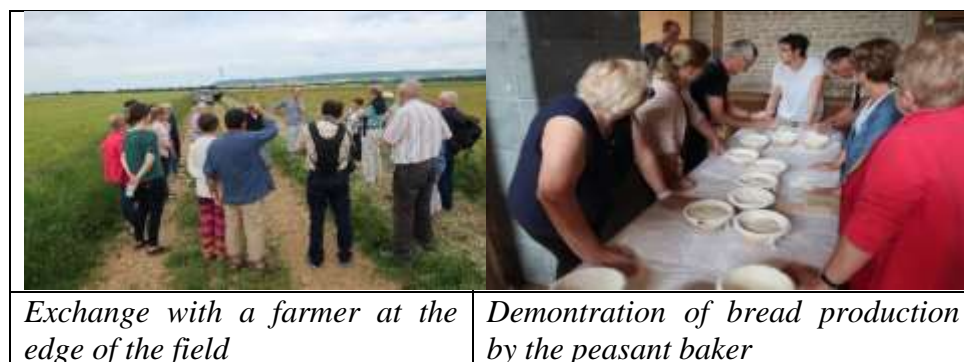
Exchange with a farmer at the edge of the field

Burgundy, June 2018 : 70 persons who are actively engaged in the agro-ecological approach and production in short circuits gathered in Burgundy, France in June 2018 in order to share their best practices and to learn from one another. The meetings and sharings were organised in 3 farms with 3 different approaches to agro-ecology. Similarly other events have been organised in other regions ; in Brittany, around 100 people were gathered on 29 September 2018 for an "exchange on the fragility of the rural world".