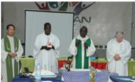
The international character of our celebrations with the chaplains from Korea, Burkina Faso, Senegal, Argentina