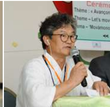
President of KCFC , the very active movement in South Korea