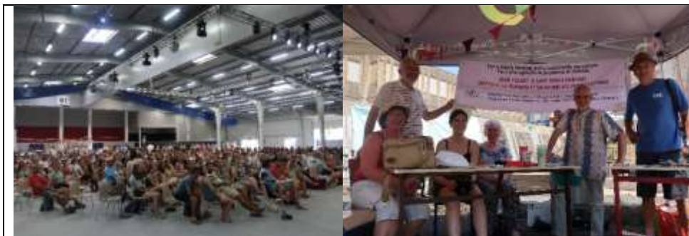
The general meeting on the conditions of the world peace

The International Peace Festival was organised by MRJC (France) and KLJB (Germany) from 2-5 August 2018, in Besançon (France). Around 3000 young Germans and French participated in 3 days gathering. Numerous round tables on local development, food sovereignty, the future of Europe, the conditions for a world peace, disarmament etc were held. FIMARC and CMR participated in this event and orgnised a stand