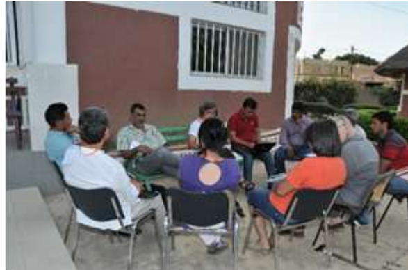
Continental meeting of the Latin America delegation and portage of an intermovement projects