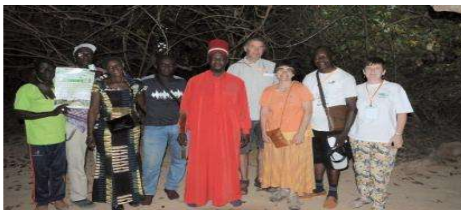
FIMARC delegates welcomed in Casamance

FIMARC presence to the whole of the Senegalese Church. This immersion took place in 6 of the 7 dioceses of Senegal. Ten groups of 4 or 5 delegates were welcomed by local MARCS officials in the dioceses of Thies, Dakar, Kaolack, Ziguinchor, Kolda and Tambacounda. For a linguistic