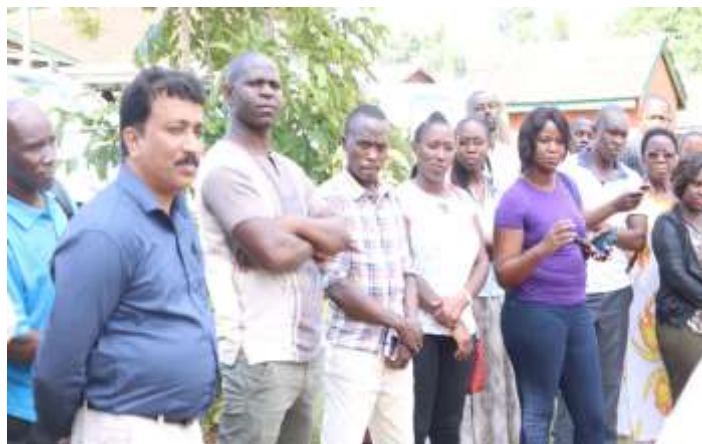
Group in a field visit at Monor House Kitale