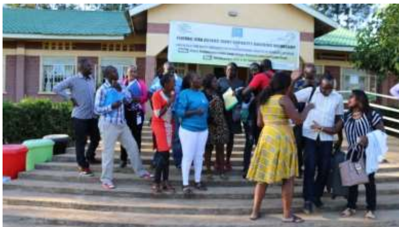
Group at DESECE Centre Kenya