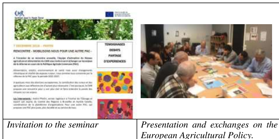
Invitation to the seminar

The annual seminar of CMR organised by the Agriculture and Food Network commission in December 2018 focused on the theme "Let's mobilize for another Common Agricultural Policy" came up with with a final press release from CMR recalling "what we want" and "what we do not want" around 4 orientations: maintenance of the vitality of rural territories; coherence of the CAP with the development of the countries of the South; preservation of the environment, food quality and health; promotion of the peasant profession.