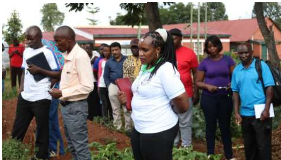
Group at Monor House Kitale - field visit

The workshop was attended by six African countries namely : Burundi, Cameroon, Kenya (host), Rwanda, Uganda, Zambia & Brussels