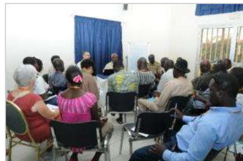
The Market Place, an interactive exchange about the PDLP working method

This seminar time was completed in the evening by a presentation session on the intervention of the Senegalese state in rural development by the representative of DRDR of Thiès, and by the representative of regional Caritas of Thiès. The cultural evenings have also complimented the sharing sessions between delegates from different continents.