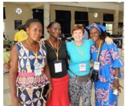
Parity Men and Women: a wealth to become in our movements